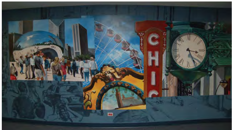
Hand-painted murals by a local artist adorn the walls of the building.

Ingalls Behavioral Health Services recently expanded to better meet the needs of all patients, including its adolescent population.